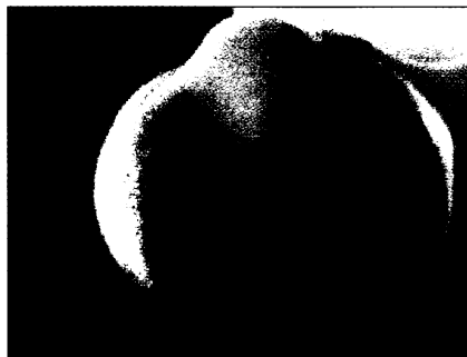
During frog development, the gene ET turns on (black areas) in two bands of tissue (left). Within a few hours, the upper band splits into two regions that ultimately form the retinas of the eyes (right).