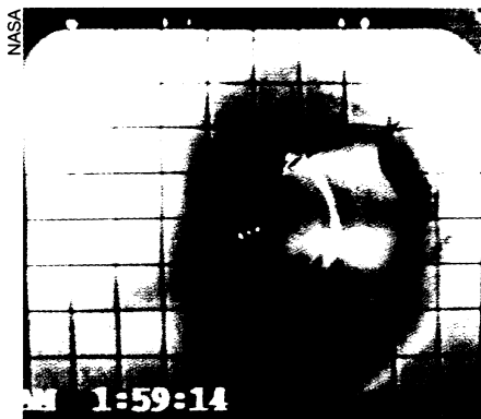
A flame in space, unlike one on Earth, burns into the breeze in this experiment.