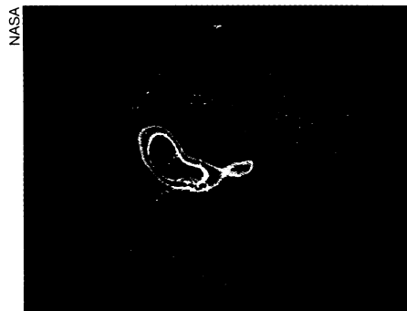
X-ray image of Earth's aurora, taken April 10 by the Polar satellite, shows that the fireworks extended below the Canadian-U.S. border. Red denotes the highest intensity, blue the lowest.

Curiously, he notes, the Wind craft, situated so that it detects solar disturbances about an hour before they get to Earth, recorded two large increases in the density of ionized gas. One increase occurred about 3 p.m. eastern daylight