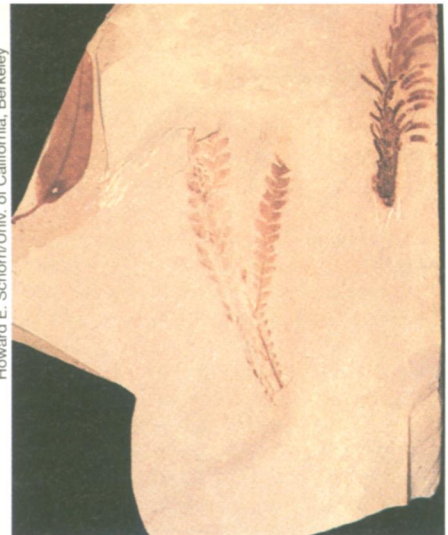
Leading the high life: Fossil leaves from western Nevada indicate that the region's elevation 16 million years ago was nearly twice its current altitude.