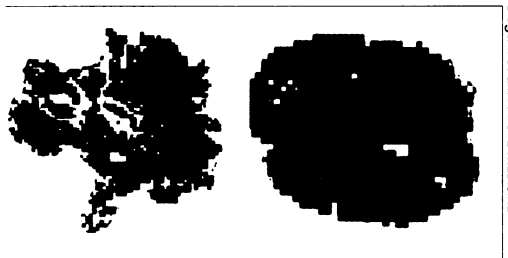
MRI scans of malignant (left) and benign (right) human breast tumors. Red indicates that the dye flows into and out of the tissue slowly, green reflects moderate flow, and blue denotes fast flow.

"You must be willing to bet your paycheck on a simulation," says Sandia's Russell Skocypec. —I. Peterson