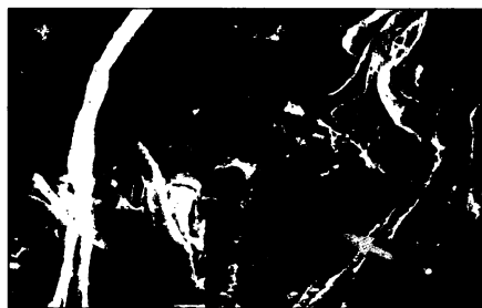
Left: Micrograph of a dollar's surface shows fibers' bladelikey edges and a relatively large hole (arrow), about 100 micrometers across at its narrowest dimension. Right: A roughly 10-µm cocaine particle (arrow) trapped in such a hole.