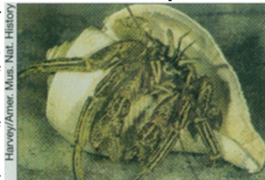
The striped hermit crab is a lopsided, happy homeowner.