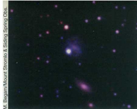
The bright spot at the center of this visible-light image gives evidence of the supernovalike explosion.

The recent stellar explosion is fascinating in its own right, says Kulkarni. The