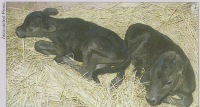
Newborn calves, cloned from adult cells.