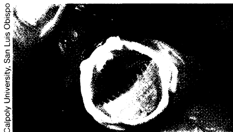
The cookie-cutter shark's teeth gouge plugs of flesh out of bigger creatures.

The density of the light cells make the blank patch all the more puzzling, Widder points out. "You've got this absolutely perfect counterillumination pattern, and you screw it up—why?"