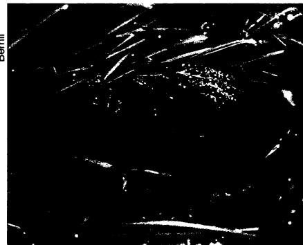
Endosulfan proves toxic to tadpoles of three species, including American toads.

hatched normally, Berrill's team reports in the September ENVIRONMENTAL TOXICOLOGY AND CHEMISTRY , the highest pesticide concentrations caused the resulting tadpoles to temporarily exhibit a depressed "avoidance behavior." This would have rendered them vulnerable to predation, the researchers say.