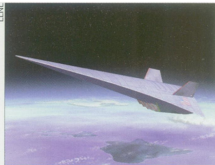
Proposed HyperSoar aircraft skims past Hawaii in artist's rendering.

Carter claims that HyperSoar is superior, but Hunt says both approaches need more detailed analysis. Neither group has yet investigated possible adverse environmental effects from emissions or sonic booms, which have plagued attempts to develop slower, supersonic transport planes (SN: 10/7/95, p. 229). —P. Weiss.