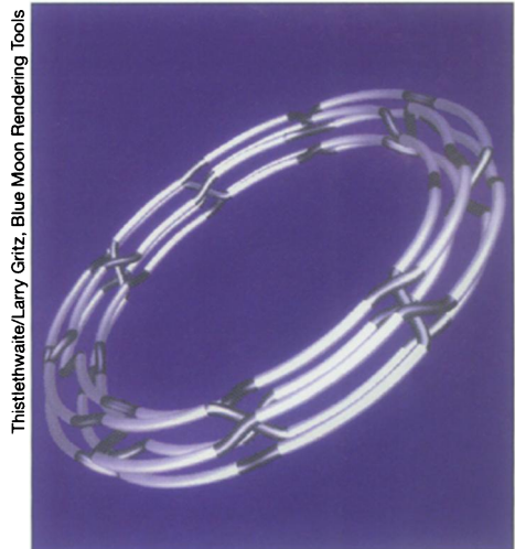
Example of a 16-crossing knot.

help of computers, Hoste, Weeks, and Thistlethwaite produced independent tabulations of knots with 16 or fewer crossings. Kept secret until they were finished, the two lists were in complete agreement.