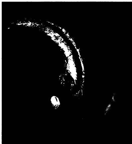
Thumb claw of the African dinosaur.

The new find by Sereno and his colleagues reveals that spinosaurids had faces even more extreme than previously recognized. The snout of Suchomimus extends 25 percent farther than researchers had calculated for other spinosaurid specimens. The animal would have reached 11 meters in body length and had thumb claws measuring 33 centimeters long,