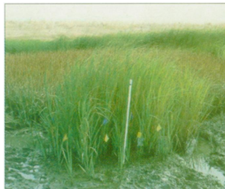
The taller, prolific Eastern cordgrass (brighter green) threatens California's native species (middle ground).

It's no wonder, laments Strong, that these super sires "are spreading like wildfire." He worries about the "genetic pollution" of the native species' genome and predicts disastrous impacts on the other creatures of the bay. The hybrids spread farther down the mud flats than