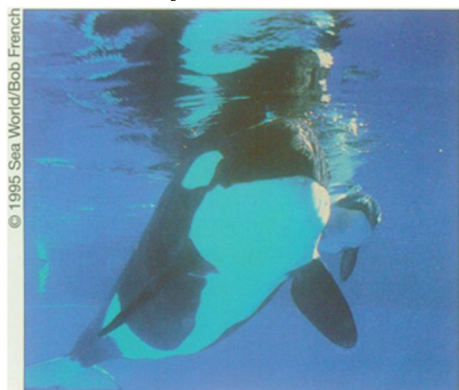
The killer whale's low diversity in its mitochondrial DNA may come from its traditions and sociability.

The team interprets the oscillation within the lattice that creates the pulses as the first evidence in a condensate of a phenomenon called the Josephson effect. In the effect, previously seen in superconductors and superfluids and of wide use in electronics, an oscillating flow of particles passes through a barrier. In this instance, planes defined by the optical laser act as barriers to the motion of atoms. —P. Weiss