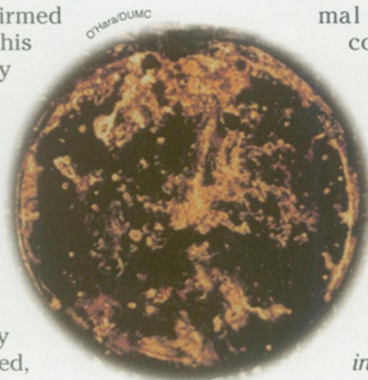
A 1989 penny after 4 days in a child's stomach.

O'Hara suspects that through normal wear and tear, this copper skin can crack, allowing the stomach's hydrochloric acid to dissolve some of the zinc into a toxic, ulcerating soup. She notes that other U.S. coins, made mostly of nickel, pose no similar risk. —J. Raloff