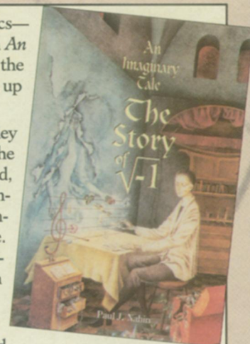
Princeton University Press, 1998, 257 pages 6 1/4" x 9 1/4", hardcover, $24.95

Addressing readers with both a general and scholarly interest in mathematics, Nahin weaves into this narrative entertaining historical facts, mathematical discussions, and the application of complex numbers and functions to important problems, such as Kepler's laws of planetary motion and ac electrical circuits. This book can be read as an engaging history, almost a biography of one of the most evasive and pervasive “numbers” in all of mathematics.