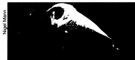
A center in the zebra finch's brain proves very sensitive to song during sleep.

He also predicts that the finding will not settle the debate over the motor the-