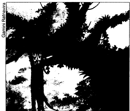
The resplendent quetzal's prized tail-feathers can grow 75 centimeters long.

The ancient Maya demonstrated in numerous ways the technical prowess to knowingly create the world's first "soundscape," Lubman maintains. Besides the obvious marvels of the temples and vast cities constructed without benefit of the wheel or metal tools (SN: 1/24/98, p. 56), the Maya were also the sole ancient New