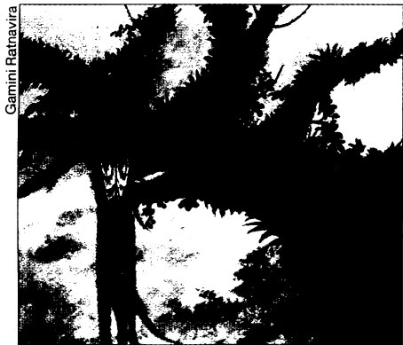
The resplendent quetzal's prized tail-feathers can grow 75 centimeters long.