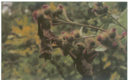
National Park Service biologists confirm that this plant is burdock.

The story on the entrapment of hummingbirds by burdock was interesting but hardly seemed newsworthy. As a caver, I have for some time observed entrapment of bats on burdock near cave entrances. In fact, I believe this to be common knowledge in the caving community.