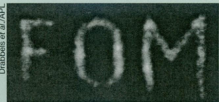
Infrared light passed through a stencil and ionized atoms to record these letters.

on a screen, creating an image of the infrared light.