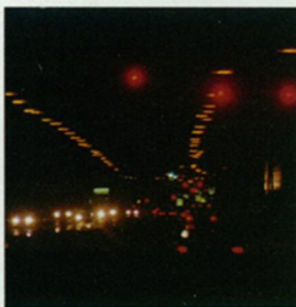
In dimness, objects may seem to be moving less rapidly than they really are.