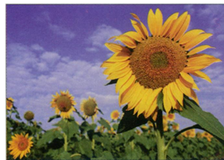
When under stress, sunflowers and other plants emit toluene, a volatile organic compound previously thought to come only from nonbiological sources.

Putting stress on the plant turned up its toluene production. When the re-