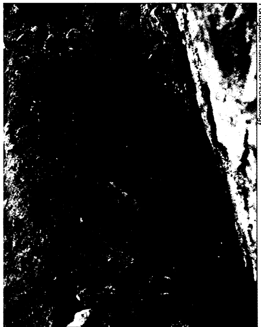
Portuguese Institute of Archaeology

Strain energy distribution in knotted polymer strands consisting of 35 carbon atoms (left) and 28 carbon atoms (right). In the tighter knot (right), the strain energy is highest (shown in red) at bonds immediately outside the knot's entrance points.