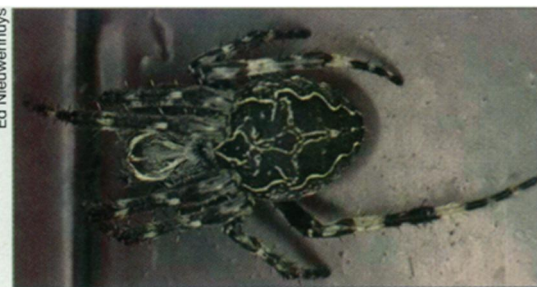
This nocturnal orb-web spider shows an intriguing preference for light.

cial light and fed them in both darkness and daylight so they would not associate light with food. When put into the artificially lit test box, 14 out of 15 spiders chose to build webs in the light side.