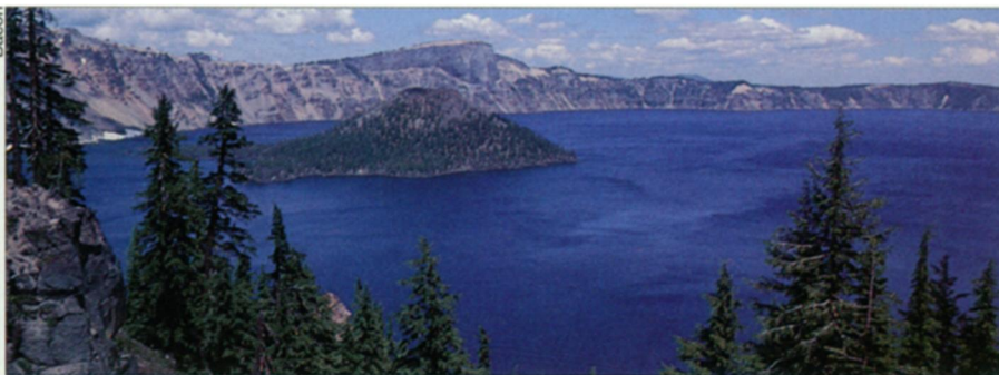
Born in a blast, Crater Lake measures almost 6 miles across.