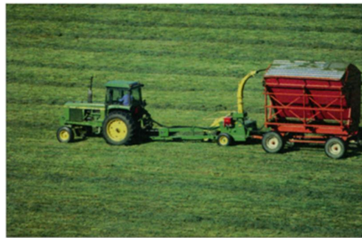
Carbon may be hiding in farmers' fields.