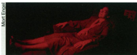
Experiments remove sensory interference to investigate telepathic communication.