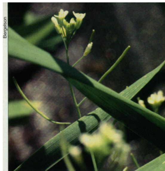
For millions of years, this mustard species, Arabidopsis thaliana , has deployed the same defense against a pesky rot.