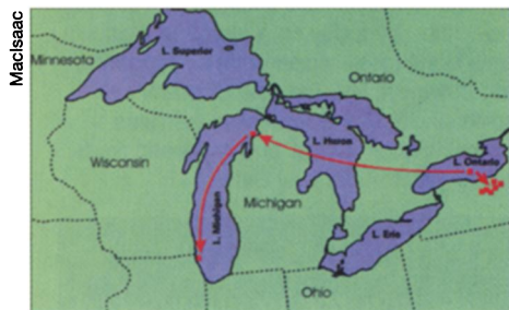
The spread of fishhook water fleas from Lake Ontario to Lake Michigan and six of New York's Finger Lakes—probably by unintentionally transferred water.

Although Europe and Africa may have ringside seats this year, North America, especially the East Coast, could also witness some fireworks. Start gazing eastward around midnight, when the constellation Leo rises. Viewing might improve after the moon sets, but activity may have dwindled by then. —R. Cowen