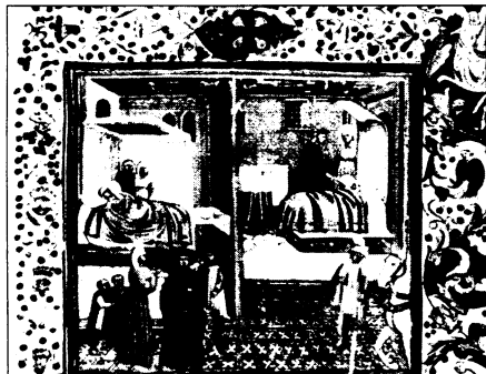
Illustrations from the Canon of Medicine.

For instance, the canon takes the radical