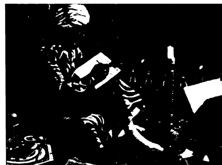
Between treating patients, Ibn Sina takes time for poetry.

Although fossil shells look superficially like living mollusks, scrutiny reveals that they are not identical to any known today. "Our English Quarry-shells were not cast in any Animal mold, whose species or race is yet to be found in being at this day," he said