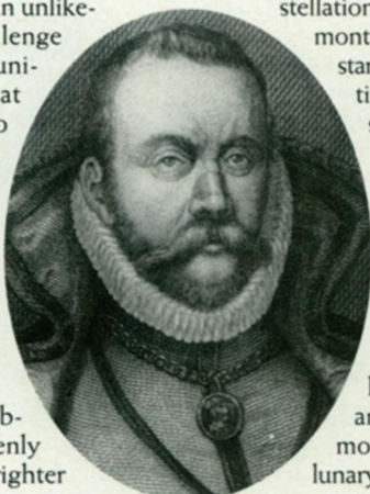
Tycho Brahe is famous for his precise measurements.

The young astronomer had just built a new version of a sextant, a compass-shaped device that accurately measures the latitude and longitude of distant objects. Tycho's sextant, which features 5.5-foot-long arms joined by a brass hinge, is unsurpassed in detecting the subtle movement of distant objects, he says. When he applied the device to the bright apparition, he reports in his book De Stella Nova , it stood stock-still and so must be a star.