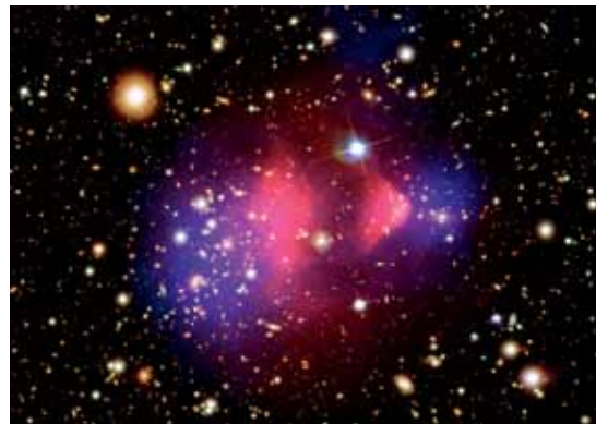
In this false-color image of galaxies colliding, the majority of the mass (blue) is separate from most normal matter (pink), direct evidence of dark matter.

probe dark energy from the ground and in space (see Page 32). In particular, precision measurements of many distant galaxies could help pin down the nature and distribution of dark energy. A new camera, optimistically called the Dark Energy Survey, will see first light this autumn at the Cerro Tololo Inter-American Observatory in Chile. Real light — insight into the dark — may take some time. ■