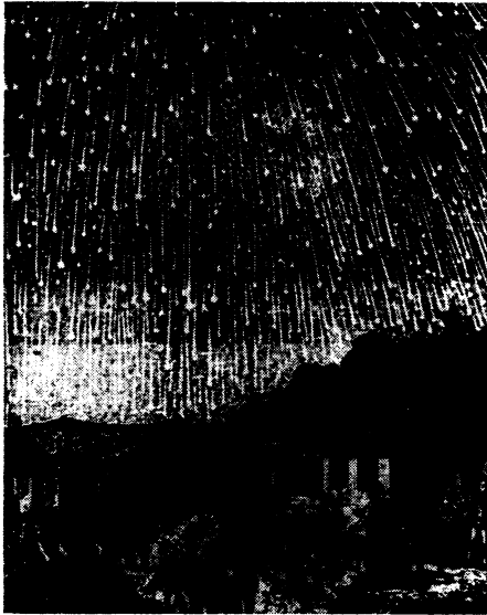
19th Century Wood Cut

Of the dozen meteor streams that the earth runs into every year in its journey through space, the Leonids—although not providing the highest number during an hour of viewing—usually make