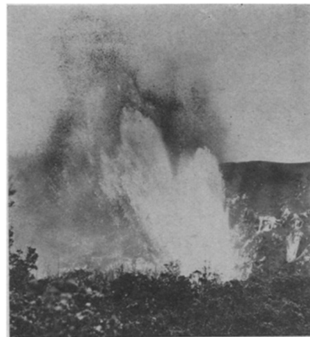
U.S. Geological Survey