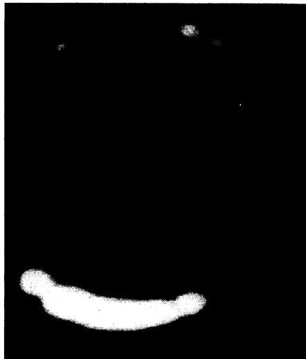
Eclipse of the sun by the earth.

Besides photographing its own diggings, Surveyor took pictures of the surrounding terrain for scientists hunting Apollo landing sites. In addition, it sent back photos of the earth, of Venus, and even, when the earth got between the spacecraft and the sun, of a solar eclipse. During the eclipse, Surveyor photographed the moon through red, blue and green filters over the