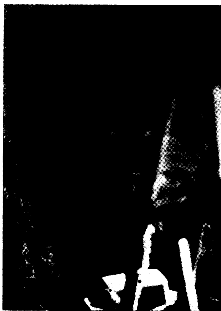
Moon dirt: strong enough for two.

camera lens, in order to see what color the lunar surface might be in that kind of lighting. Scientists also hoped to get accurate measurements of the moon's surface temperatures during the eclipse.