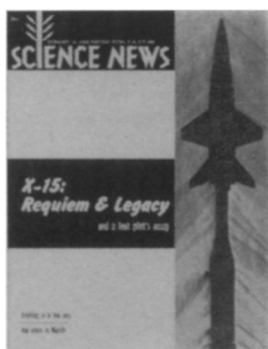
A Science Service Publication Vol. 93 / February 24, 1968 / No. 8 Science News Letter ®

X-15 model and shock wave patterns in a wind tunnel. Having made its contributions to the future of aviation, the X-15 falls victim to the budget-cutters' ax. It now is a candidate to join the other relics in the Smithsonian Institution. P. 188.