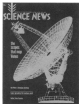
A Science Service Publication Vol. 93/March 30, 1968/No. 13 Science News Letter®

If proper transmitting and receiving equipment is installed, radiotelescopes can be turned into active radar installations. Beams reflected from nearby planets can have high enough power to reveal locations of surface features when they are properly analyzed. p. 309