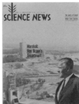
A Science Service Publication Vol. 93/April 13, 1968/No. 15 Science News Letter®

America's Rocketland is the Marshall Space Flight Center, a Space Age outpost in the out-back of northern Alabama. With NASA's leading light, Dr. Wernher Von Braun at the controls, Marshall influences the fortunes of an entire area. p. 362.