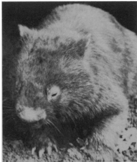
Wombat: lovable nuisance