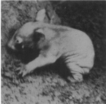
Baby wombat—a dollar a scalp.

Broken fences let in ravenous rabbits, and a busy farmer is justifiably annoyed if he has to mend fences broken by wombats. But wombats have never been sufficiently numerous to endanger