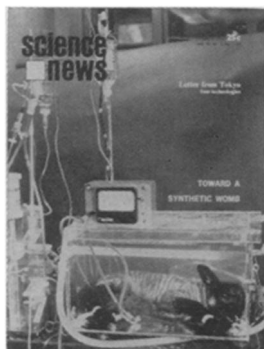
An unborn lamb reclines in an artificial womb—a clear plastic tank—receiving vitamins and amino acids through intravenous feeding and oxygen from an artificial membrane lung (spool-like objects at left). p. 12

A Science Service Publication Vol. 96/July 5, 1969/No. 1 Science News Letter ©