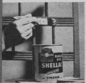
Learn how to refinish furniture with spray or brush, in antique, crackle, leather, and other lovely finishes.

Mail the attached Gift Certificate Card or Gift Coupon below to discover for yourself how to save more money than you ever dreamed possible with "The Practical Handyman's Encyclopedia."