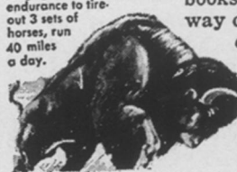
Giant heart and lungs give Bison endurance to tire-out 3 sets of horses, run 40 miles a day.

BOOK DIVISION, Wild Life Press, Dept. 2514 Box 707, F. D. Roosevelt Sta., New York 10022