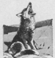
Clever coyote may ignore unarmed man, but hunter with gun rarely gets in range.

Multiply these snatches of animal lore a thousandfold — by the length and breadth of America — and you have AMERICAN WILD LIFE — one of nature's greatest collections of living wonders on this earth!