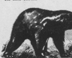
Fish, ants, crabs, tree shoots, pigs, cattle, sheep — all spell food to hungry Black Bear.