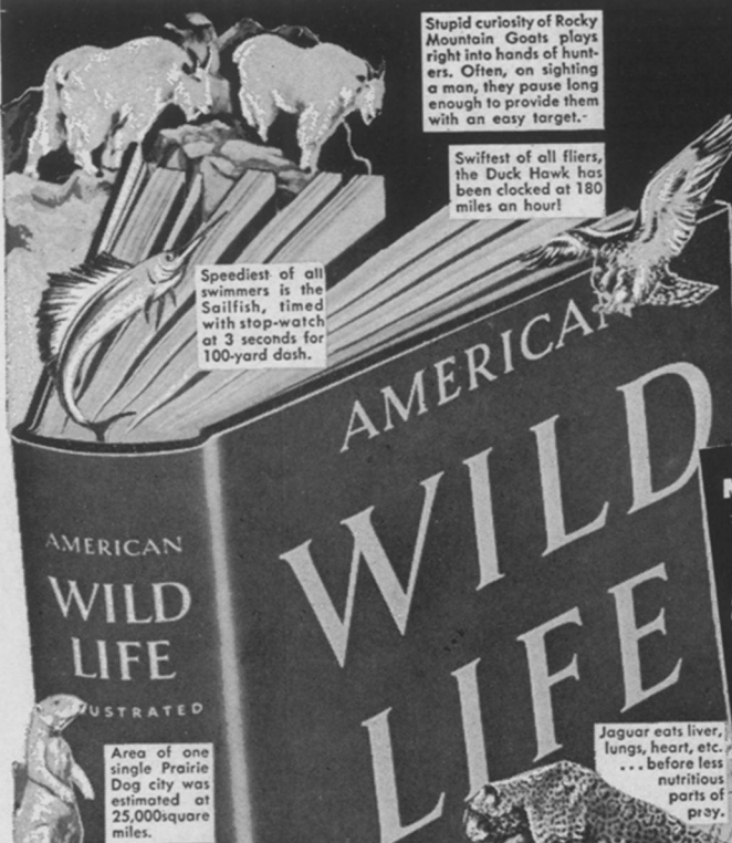
Stupid curiosity of Rocky Mountain Goats plays right into hands of hunters. Often, on sighting a man, they pause long enough to provide them with an easy target.

"Most Complete Volume on Wild Life in 35 Years!"