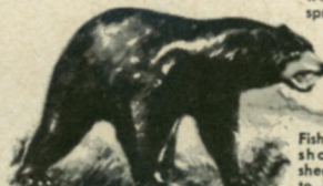
Fish, ants, crabs, tree shoots, pigs, cattle, sheep — all spell food to hungry Black Bear.