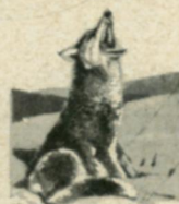
Clever coyote may ignore unarmed man, but hunter with gun rarely gets in range.

Multiply these snatches of animal lore a thousandfold — by the length and breadth of America — and you have AMERICAN WILD LIFE — one of nature's greatest collections of living wonders on this earth!