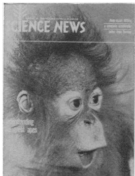
Aside from chimpanzees, man ignored great ape behavior until the 1960's. Old fancies about orangutans (cover) and gorillas fade in the light of new observations. p. 140.