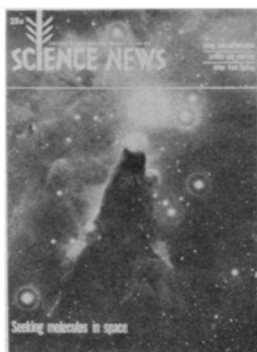
The Cone Nebula is a chaotic opaque mass of gas and dust about 1,000 light years from earth. It is a possible region for the creation of complex molecules p. 167.