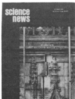
Splitting stonework high in York Cathedral is a symptom of a centuries-old disease—too much church on too little foundation. Engineers are now holding the minster together with stainless steel. p. 268

A Science Service Publication Vol. 95/March 15, 1969/ No. 11 Science News Letter ©