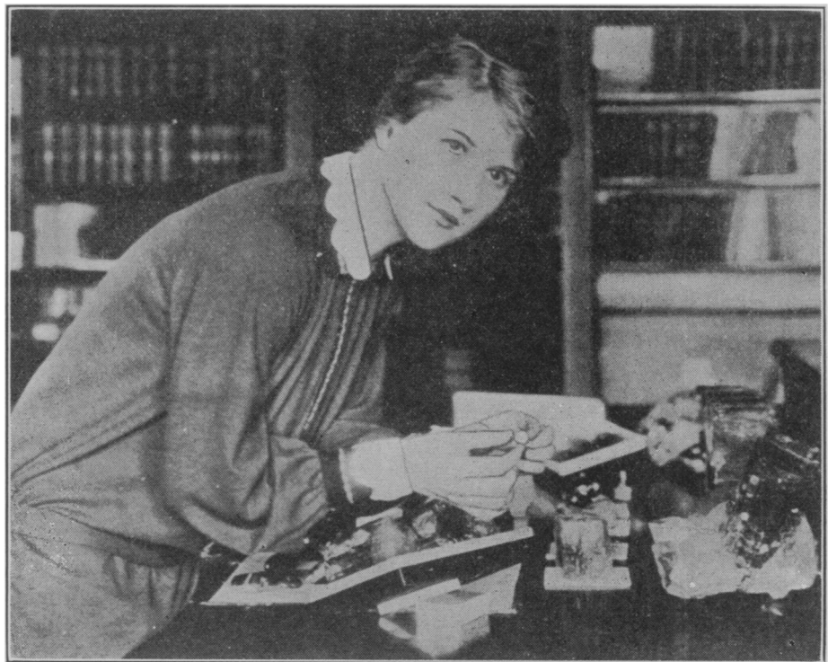
HOW WOULD YOU like to have this sure enough "Made in U. S. A.," diamond in your engagement ring? It is one of the largest found in this country.