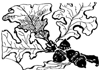
SIZES OF SEEDS

T HERE is little relation between the size of seeds and the size of plants that grow from them.